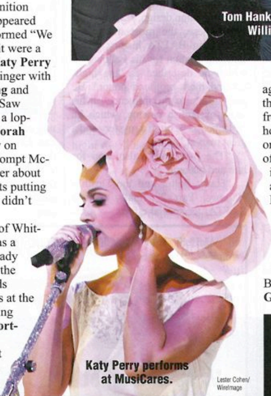
Katy Perry performs at MusiCares.