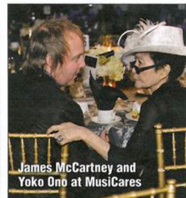
James McCartney and Yoko Ono at MusiCares