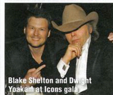
Blake Shelton and Dwight Yoakam at Icons gala