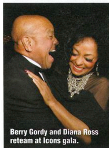
Berry Gordy and Diana Ross reteam at Icons gala.

Diana Ross pointed to her five children onstage and said, "My children are my lifetime achievement." And Allman Brothers Band founding member Gregg Allman alluded to his past