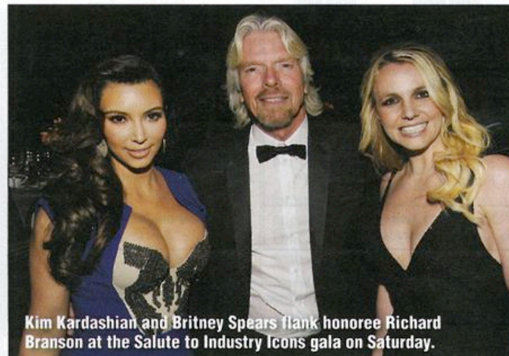
Kim Kardashian and Britney Spears flank honoree Richard Branson at the Salute to Industry Icons gala on Saturday.