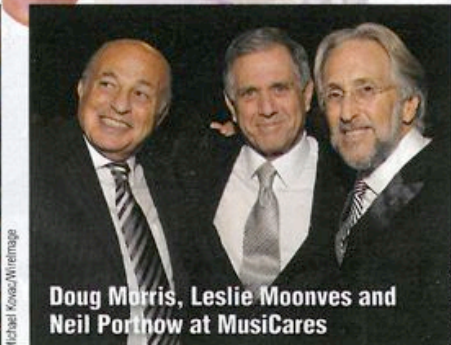
Doug Morris, Leslie Moonves and Neil Portnow at MusiCares